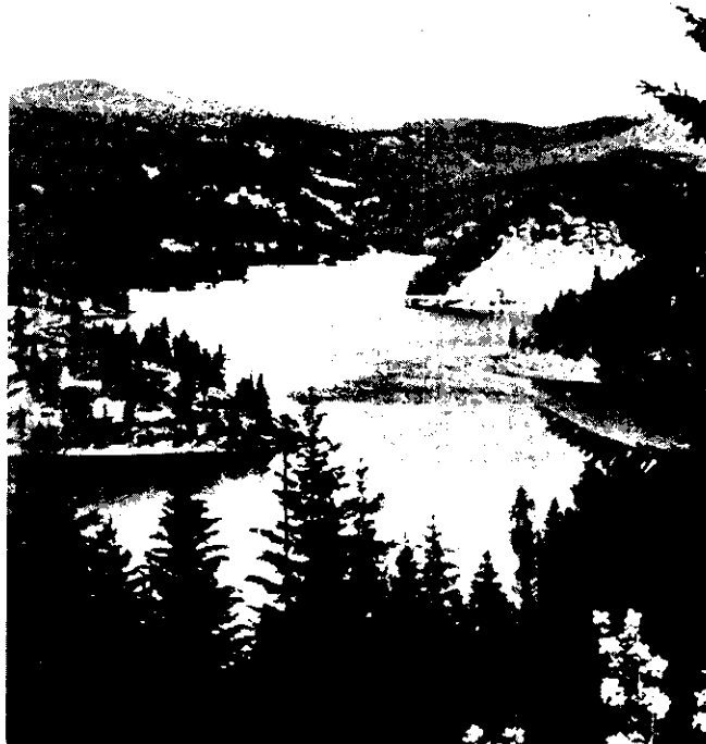
Beauty Bay, on Lake Coeur d'Alene

The Fourth Annual Conference is only a little more than three months away; for the first time, an annual meeting of the NCACC is to be held in the Pacific Northwest.