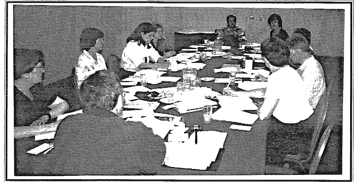
EXECUTIVE COMMITTEE MAPPING THE FUTURE OF NCACC DURING SPRING EXECUTIVE COMMITTEE MEETING PHOENIX, ARIZONA