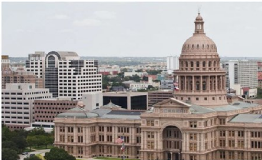
The Texas State Capitol and state offices, where the Texas Department of Information Resources is based. The department is leading the response to the cyberattacks.

The state declined to say which towns were affected by the coordinated cyberattack. But one expert said it could signal more such attacks in the future.